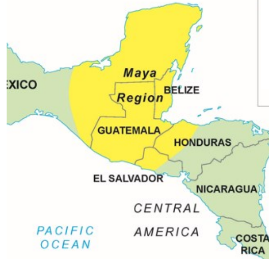
The Maya Region of Central America