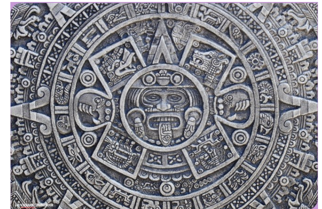
Maya Sun Calendar