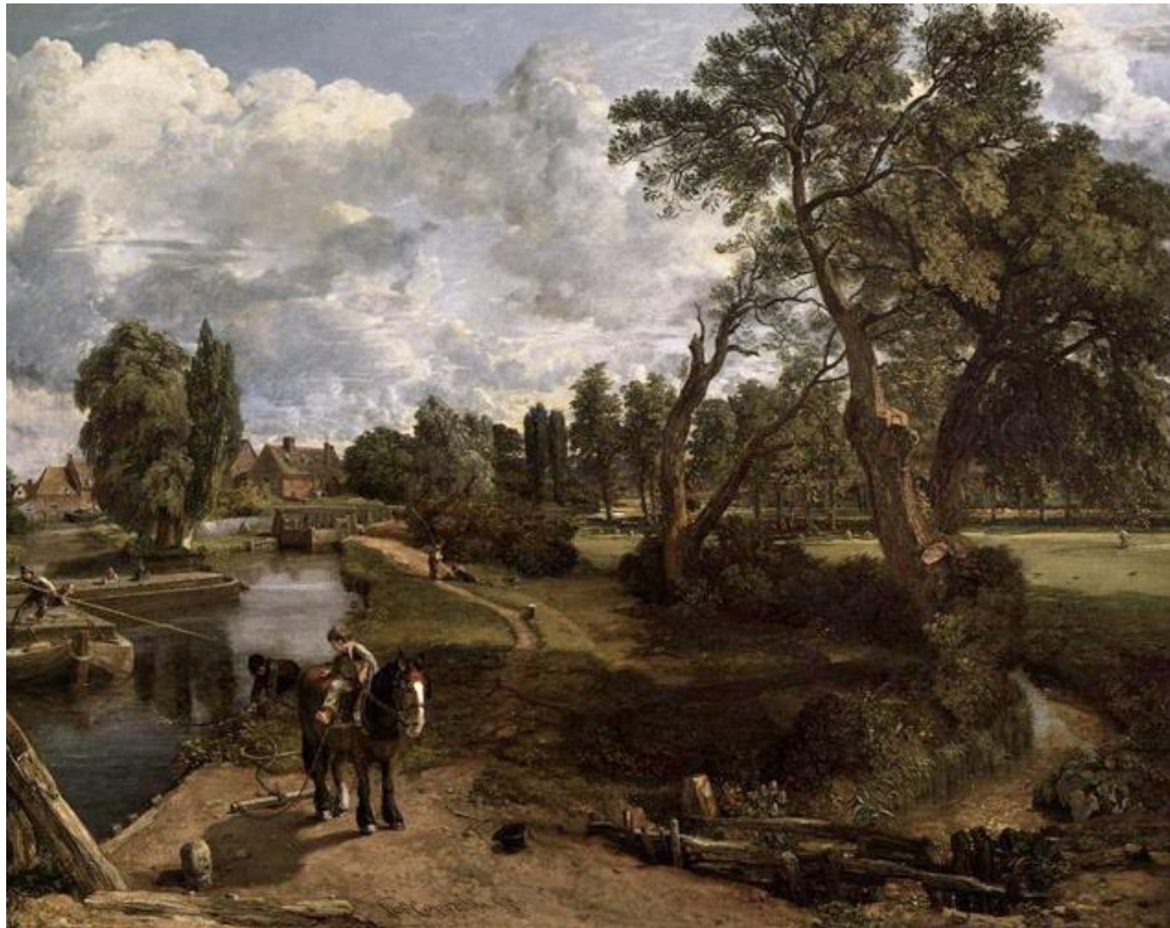
Scene on a Navigable River – John Constable