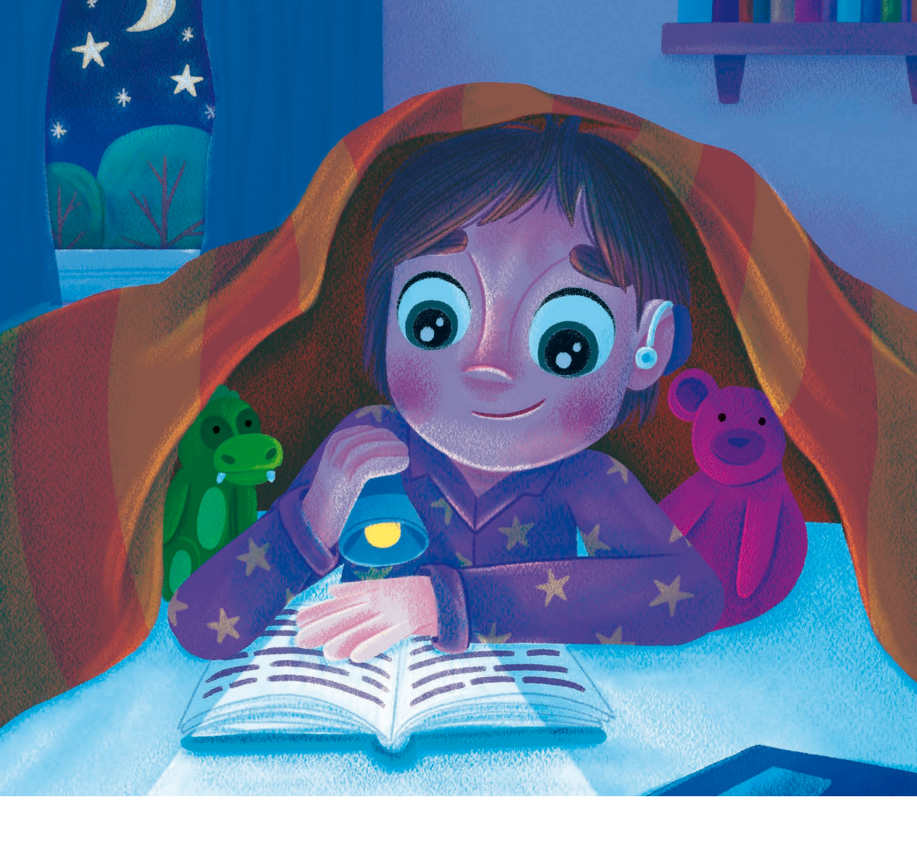
'Lee, you must sleep! It's late,' calls Mum. But Lee sits in bed and reads and reads.